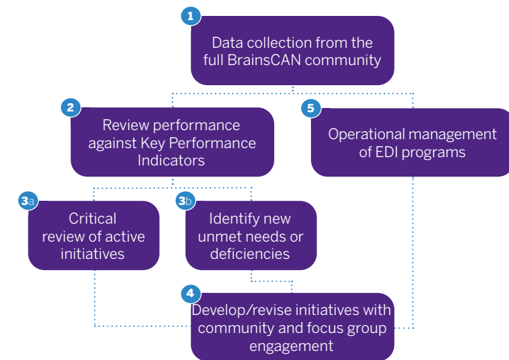
Figure 2: Agile EDI Action Plan Framework for Accountability and Optimization